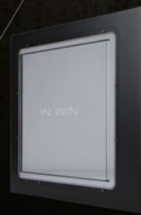
Clear Side Panel