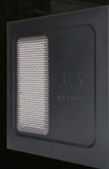
Mesh Side Panel