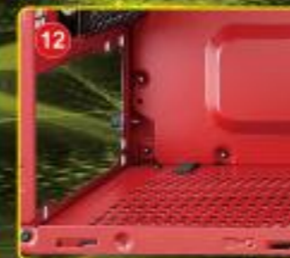
12 Bottom-placed PSU draws cool air to cool PSU