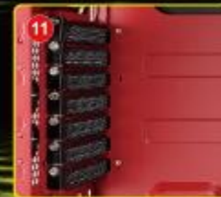
11 Perforated PCI slot for better air flow