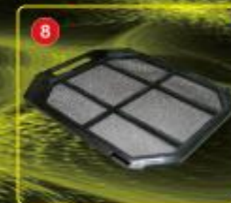
8 Filter included to prevent dust from entering PSU