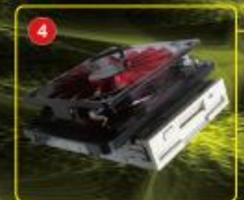
4 Fan can be mounted to the FDD adaptor to cool FDD