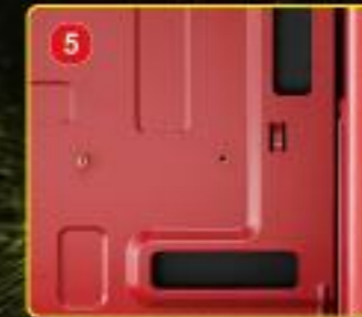
5 Pre-drilled holes for cable management