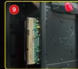
9 installation of 3.5" HDD on the (Aerocool logo section).