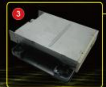
3 FDD can be mounted with adaptor