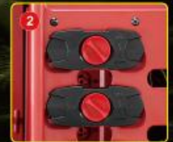
2 Tool-free for 3.25" bay