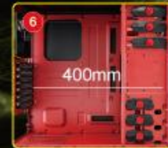
6 Sufficient depth of chassis for installing long cards