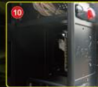
10 installation of 2.5" HDD on the (Aerocool logo section).