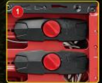
1 Tool-free for 5.25" bay