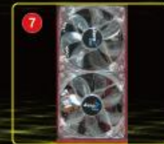
7 Can mount 2x12cm fan on front panel