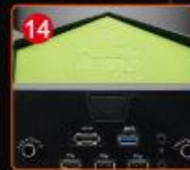
Storage compartment with anti-slip rubber pad