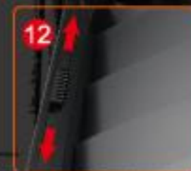
Open and shut switch for the top ventilation