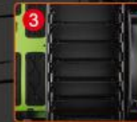
Front air intake 23cm fan with LEDs