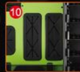
Pre-drilled holes for cable management "with Rubber protection".