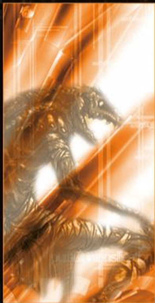
Ultimate Gaming Series