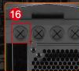
Pre-drilled water pipe holes with one of them for USB3.0 cable