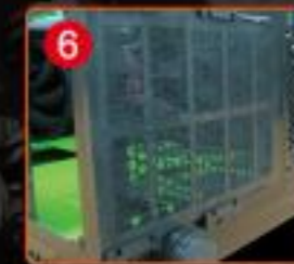
Dust filter for the bottom vent holes