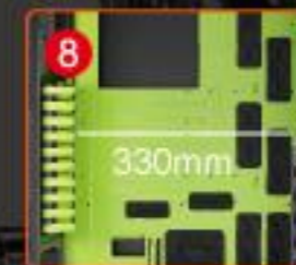
Sufficient depth of chassis for installing long cards