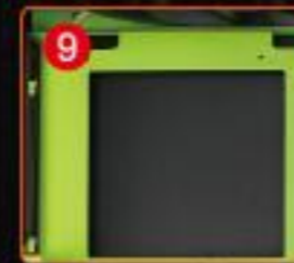
Provide easy access to CPU cooler's back plate