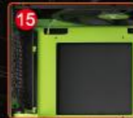
Specially designed for USB3.0 cable management