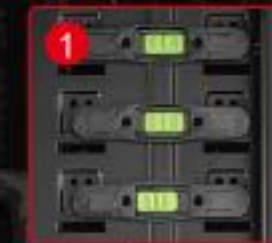
Tool-free for 5.25" bay