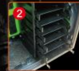
Squeeze and pull HDD tray