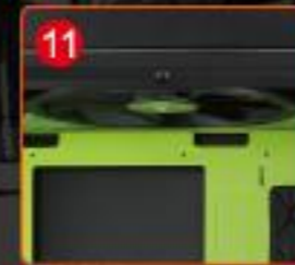
Top air intake 23cm fan