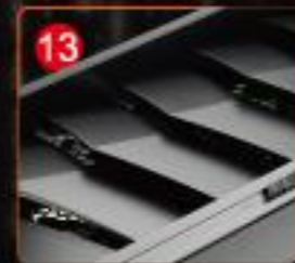
Shell-like vent structure design give an unique look