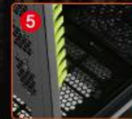
Large vent holes for PSU installed at bottom of case for great air flow