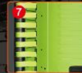
Tool-Free for PCI slots