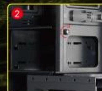
FDD rack can be removed to make room for long VGA cards