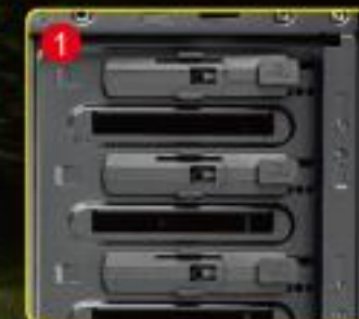
Tool-free for 5.25" bay