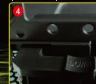
Press to release HDD cage