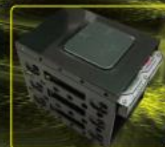
HDD cage fits three HDDs (screwless)