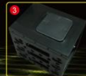
Removable HDD cage