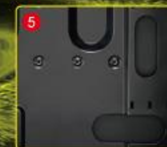
Pre-drilled holes for cable management