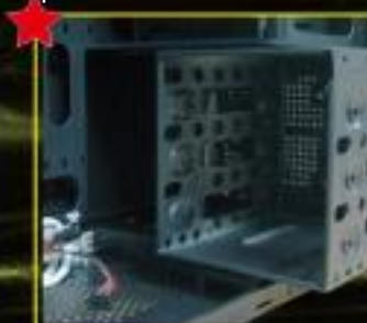
HDD Cage orientation 2: facing case rear (conventional)