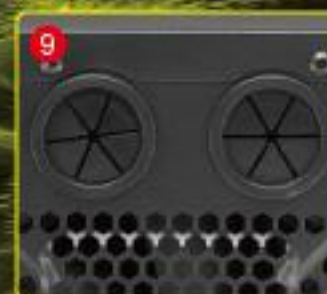
Pre-drill pipe holes for water cooling