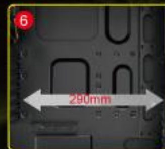
Sufficient depth of chassis for installing long cards