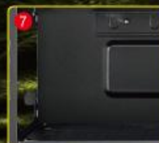
Filter included to prevent dust from entering PSU