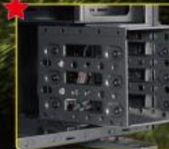
HDD Cage orientation 1: 90 degrees facing side panel