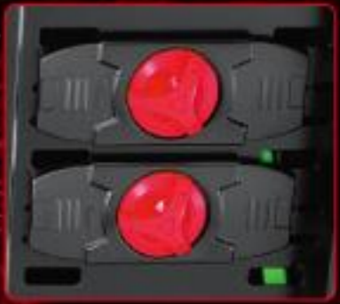
Tool-free for 5.25" bay