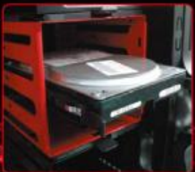
HDD cage fits three HDDs (screwless)