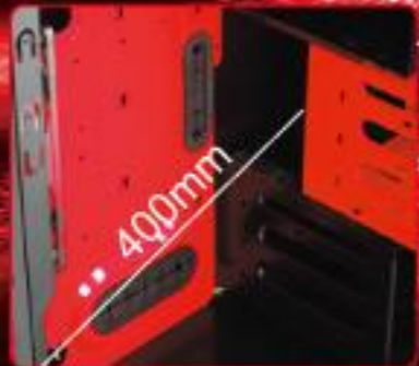
Sufficient depth of chassis for installing long cards (HDD cage removed)