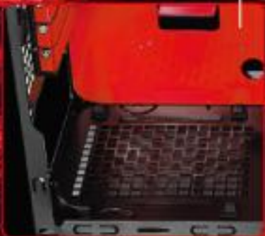
Filter included to prevent dust from entering PSU