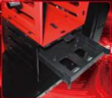
HDD tray supports 3.5" HDD and 2.5" SSD