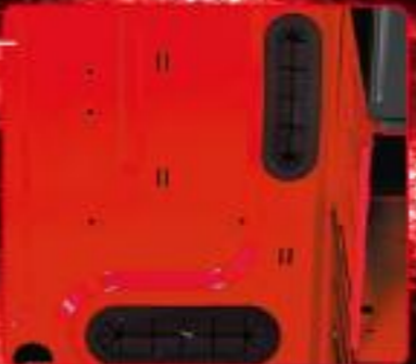
Pre-drilled holes for cable management "with Rubber protection".